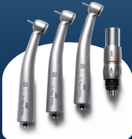
NSK's Ti-Max Z990L High-Speed Air-Driven Handpiece Bundle Shown.