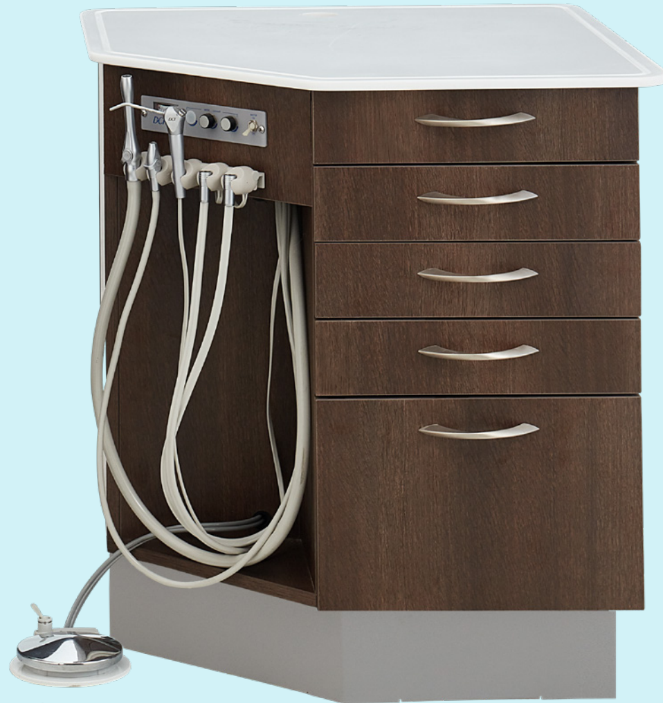
Standard Fixed Base