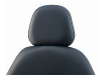
DUAL ARTICULATING HEADREST