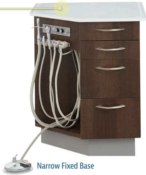
Narrow Fixed Base