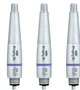
(3) iProphy Air