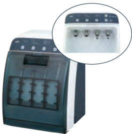
(1) iCare C2