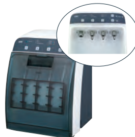
(1) iCare C3